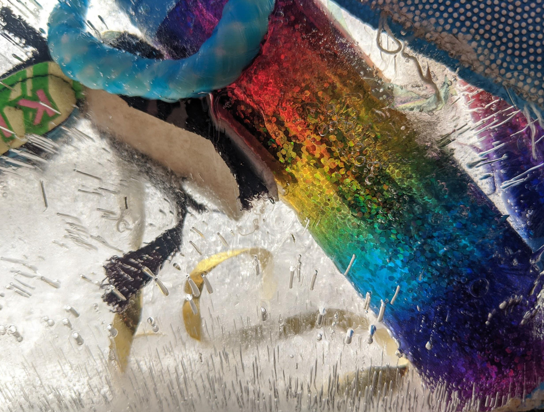
Kylie Naylor, Little boy legacy Series , Untitled #7 , 2020, Image, found objects, frozen water.