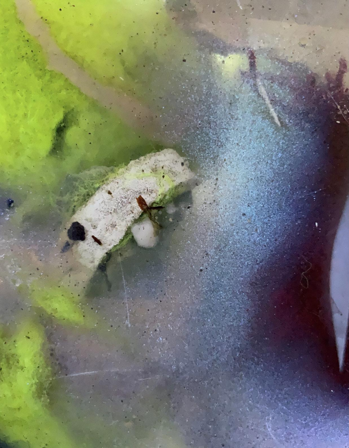
Kylie Naylor, Ball Series, Untitled #7 , 2020, Image, found objects, submerged in water and coloured hair foam.