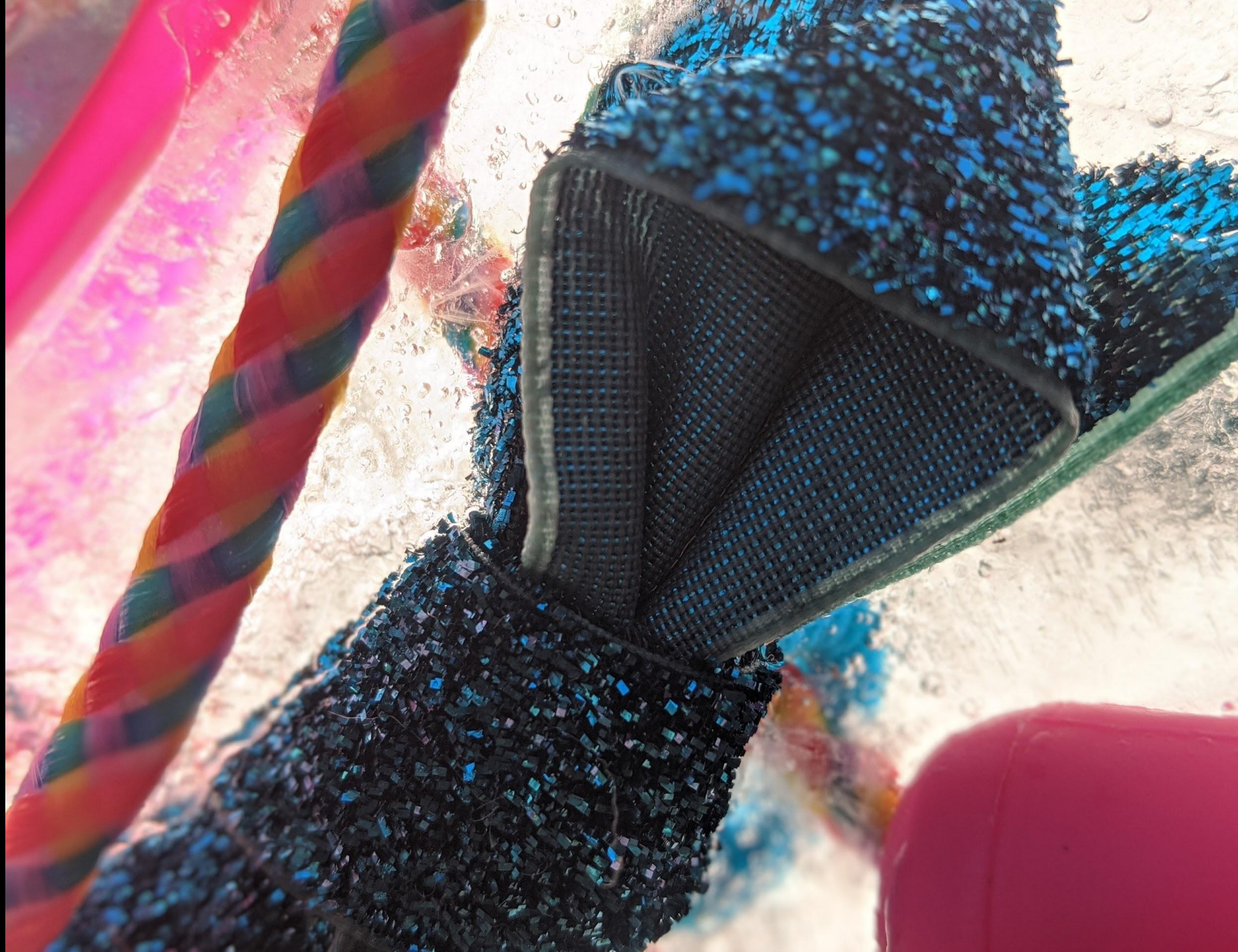
Kylie Naylor, Little girl legacy Series , Untitled #1 , 2020, Image, found objects, frozen