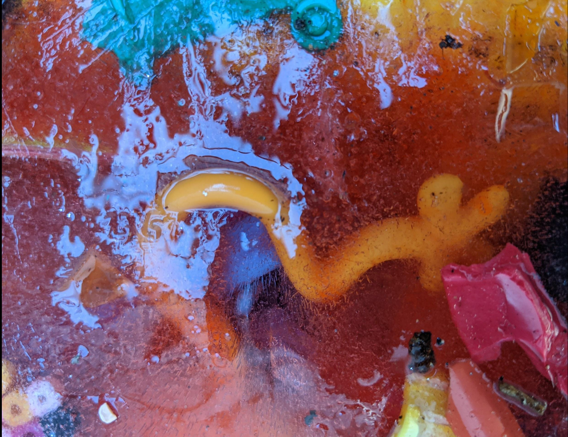
Kylie Naylor, Crushed series, Untitled #1 , 2020, Image, found objects, frozen water.